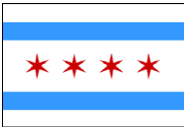
Flag of Chicago

sunny & hot and everybody had to look up to see the skyscrapers. Nothing like being at the bottom of a skyscraper trying to get a look or photo of a building!