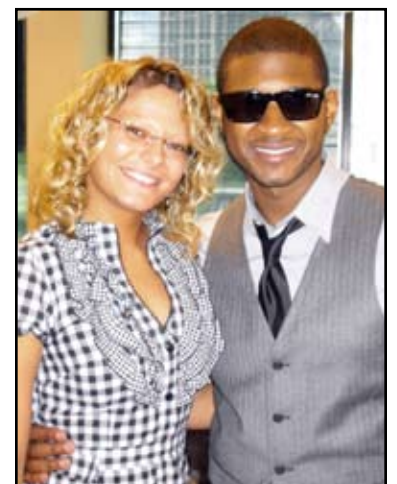
Tatjana Fertich (Germany) and Usher (2009)

We can't wait to see who they'll deliver next year, and what a treat to share in the excitement!