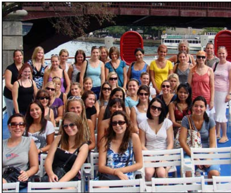
EurAupair Chicago-land au pairs, community counselors and area coordinator

We were a group of 51 people, including six newly arrived au pairs. What a way to start the au pair year. Arrive to Chicago on a Friday and be part of a huge group tour on Lake Michigan on Sunday. We always organize our boat outing at the end of August. What better way to say – Welcome to Chicago!”