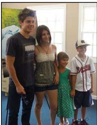
Zac Efron, Isabella Souto (Brazil) and host children (2010)

It's not everyday you wake up and hear, "Today's the day you'll meet someone with a little extra international clout." In the Morain family household, this seems to happen a little more often than it may for other Atlanta host families.