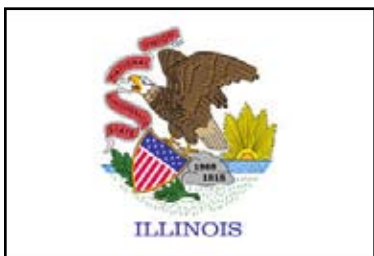
Flag of Illinois